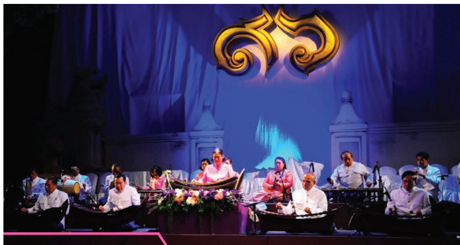
Her Royal Highness Princess Maha Chakri Sirindhorn attends the 96 th Foundation Anniversary Celebration event of Chulalongkorn University.

HRH Princess Sirindhorn arrived at the university early on the morning of Tuesday, March 26, 2013, to participate in an alms offering for 108 monks in front of the Royal Statues of King Rama V and King Rama VI. HRH Princess Sirindhorn then proceeded to the university's Main Auditorium to attend and participate in the Thai classical music performance on this auspicious occasion. The performance was given by ensembles from the university and the Bunditpatanasilpa Institute to celebrate the 96th anniversary of the university's founding.