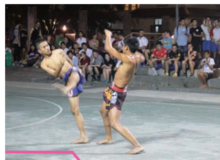
A blue Muay Thai boxer aims a hefty diagonal kick at his red opponent.