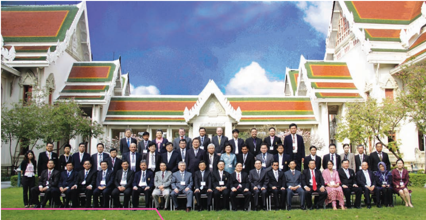
Asian University Administrators were present at the 2nd AUF co-hosted by Chulalongkorn University

The 2 nd Asian Universities Forum was held from 24 through 26 January, 2013. This prestigious event took place at the Maha Chulalongkorn Building. It was entitled “ Creating a New Vision for the Future of Asian Universities ”.