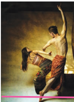
Movements of the Fawn Leb dance tell the story.