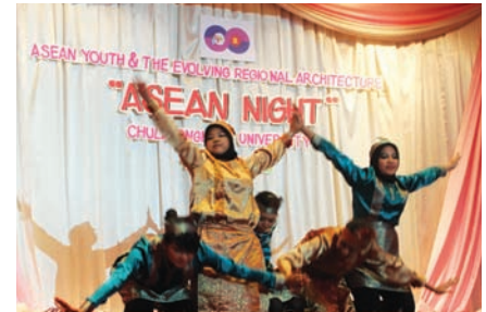
A presentation of the culture of each member country