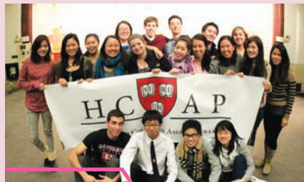
A warm welcome from the HCAP-BANGKOK delegates at the HCAP talent show back in January 2013.

HCAP-Bangkok in return has opened up a new world for its visitors, not only showing Bangkok at its best but also teaching Harvard delegates about traditional Thai culture. They were able to visit places like the Grand Palace, to learn about the traditional Thai way of living in