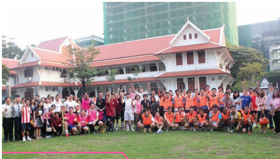
Cheerfulness, sheer bliss, and unity light up every face.