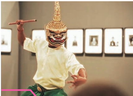
A dancer makes a theatrical Khon gestures to the rhythm of the accompanying music.