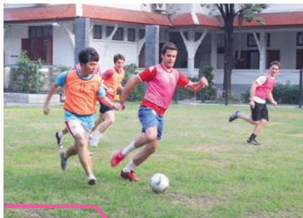
Both teams struggle valiantly to pounce on the ball.

More than 200 exchange students and Chula students in international programs congregated at the football pitch of the Faculty of Political Science on 4 February 2013 for the "CU International Sports Day 2013". Here are the highlights of the day.