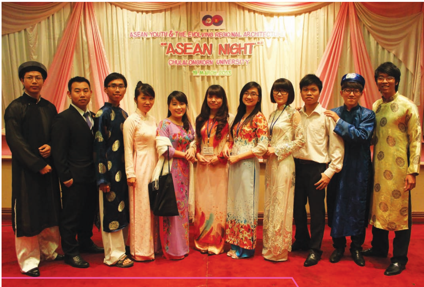
Participants display their national costumes.

In addition, most of the participants took charge of spreading awareness and knowledge they gained from the events to different levels of society, beginning at the level of their own families and extending to the national level, in order to share the deepest values of different cultures and traditions as well as enhance cultural understanding among member countries.