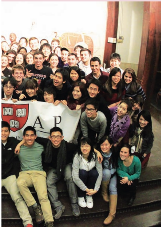
Harvard College in Asia Program 2013 at Harvard University – Cambridge, Massachusetts.

My favorite part of the trip was definitely meeting all of the different faces of HCAP-Bangkok. Being able to spend time with them in various settings from academics to social is invaluable to me. Learning about their lives and getting to know them as friends is the best take-away from HCAP every year. HCAP-Bangkok especially is really amazing because of the members' dedication and their amazing itinerary that showed us so much of Thai culture in only a week's time.