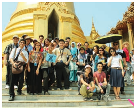
Field trips to historic sites show participants the richness of regional culture.

The 100 young participants also went on cultural excursions to the United Nations Organization in Bangkok, a historic park in Petchburi (Panakorn Kiree) the largest stupa in Thailand at Nakhon Pathom, and many other significant places. They were able to express their views