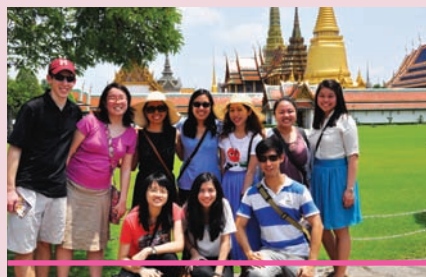
Chula students take Harvard delegates on a cultural tour to the heart of Bangkok – Wat Phra Kaew

HCAP-Bangkok in return has opened up a new world for its visitors, not only showing Bangkok at its best but also teaching Harvard delegates about traditional Thai culture. They were able to visit places like the Grand Palace, to learn about the traditional Thai way of living in