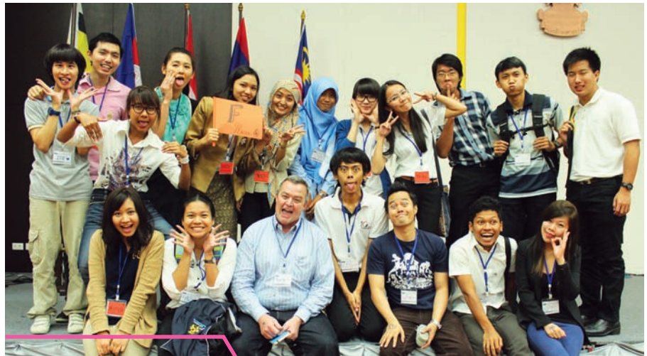
Smiles and happy faces from some student participants

Chulalongkorn University students are ready to become leading ASEAN citizens. Their success will help enable participants to reach mutual understanding and participate in focusing and strengthening regional cooperation.