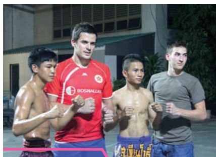
Sportsmanship crosses ethnic boundary