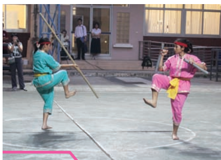
Two Thai swordsmen keep a discreet distance from each other