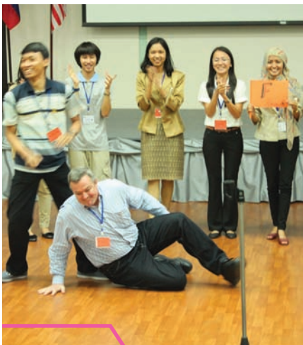
An activity draws big smiles from the participants.

The ASEAN Studies Center at Chulalongkorn University is in charge of setting up an ASEAN Project offering various programs such as "ASEAN YOUTH AND THE EVOLVING REGIONAL ARCHITECTURE" and "ASEAN YOUTH EXPLORATION" . The objectives of the programs are to enhance participation and to integrate the youth of ASEAN nations to fulfill the aim of ASEAN Community to share "One Vision, One Identity, One Community", to raise awareness of the Community's power and potential, and to ensure that