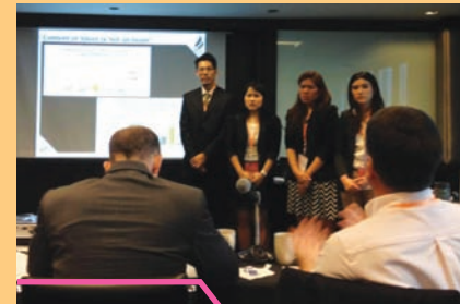
Le Lux team answers the judges questions.

The eye catcher of their business proposal was said to be their strategy, proposing that the production of gems should be more innovative and advanced, using products that contains silver alloy as part of the process. This leads