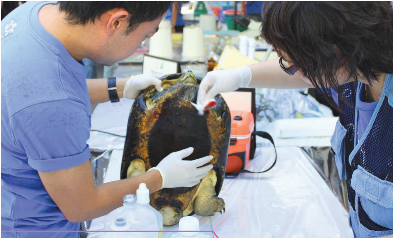
CU volunteers join together in helping save lives of turtles in danger.

The Veterinary Medical Aquatic Animal Research Center or known as VMARC have been dedicating their time to help save the lives of turtles tormented by people who believe they're actually doing good.