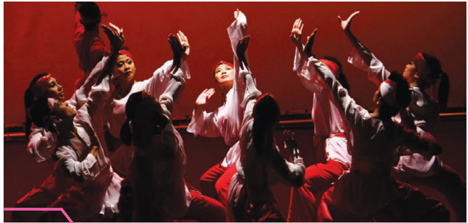
Performers give a new interpretation of gender equality based on the martial art form, silat.

It was a first for Thai theatre with “Our Roots Right Now”, which was presented by The Research Forum & Festival on Thai/ASEAN Contemporary Theatre with the wholehearted support of the university’s Academic Affairs Division, the ASEAN Studies Center, and the Maha Chakri Sirindhorn Foundation for the Faculty of Arts as well as the Thailand Research Fund (TRF). This remarkable academic and cultural event was viewed by the public from 19 to 28 January 2013 at the Sodsai Pantoomkomol Center for Dramatic Arts on the sixth floor of the Maha Chakri Sirindhorn Building, Faculty of Arts, Chulalongkorn University.